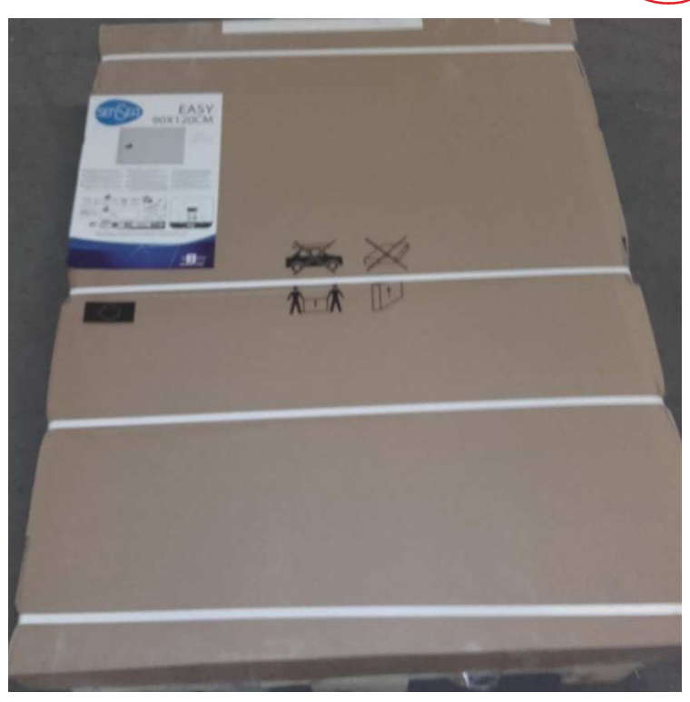
Each box is assembled with 4 PET bands