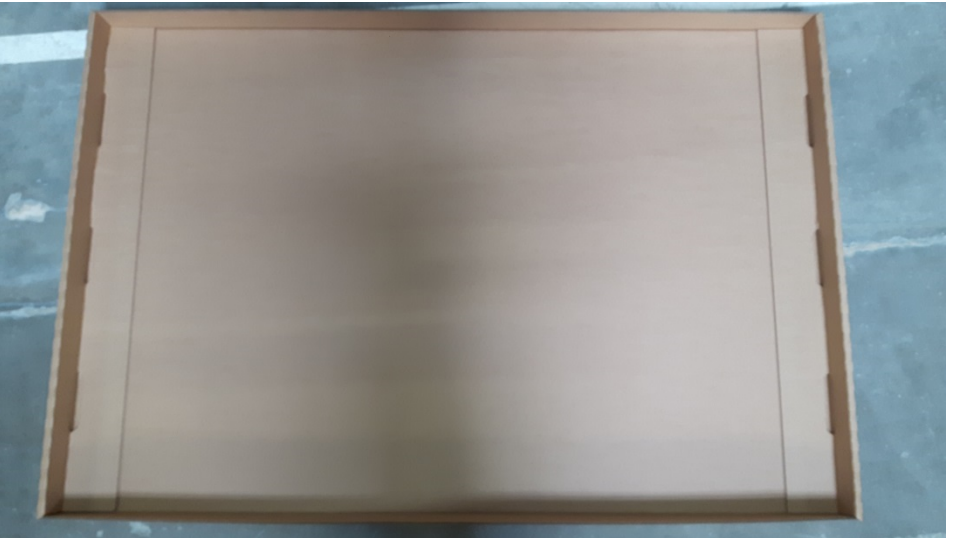
Top of the box