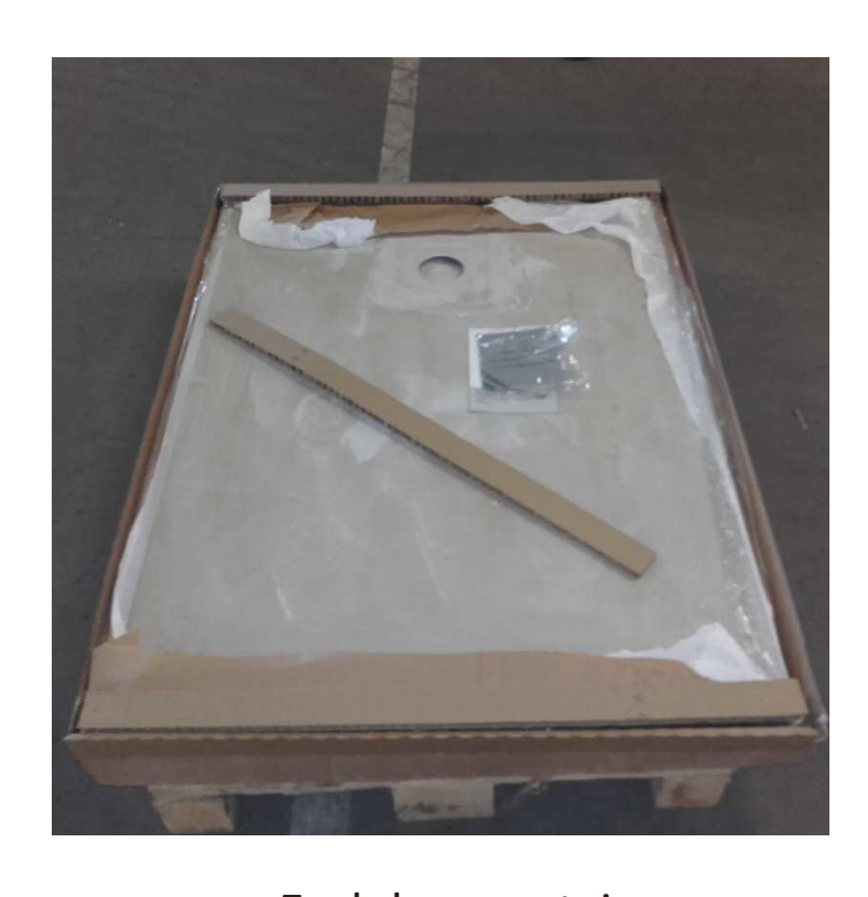
Each box contains: Shower tray (bottom site up) covered with an interfacing and paper. 3 cardboard fillers Instruction