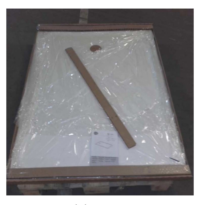
Each box contains: Shower tray (bottom site down) 3 cardboard fillers Instruction