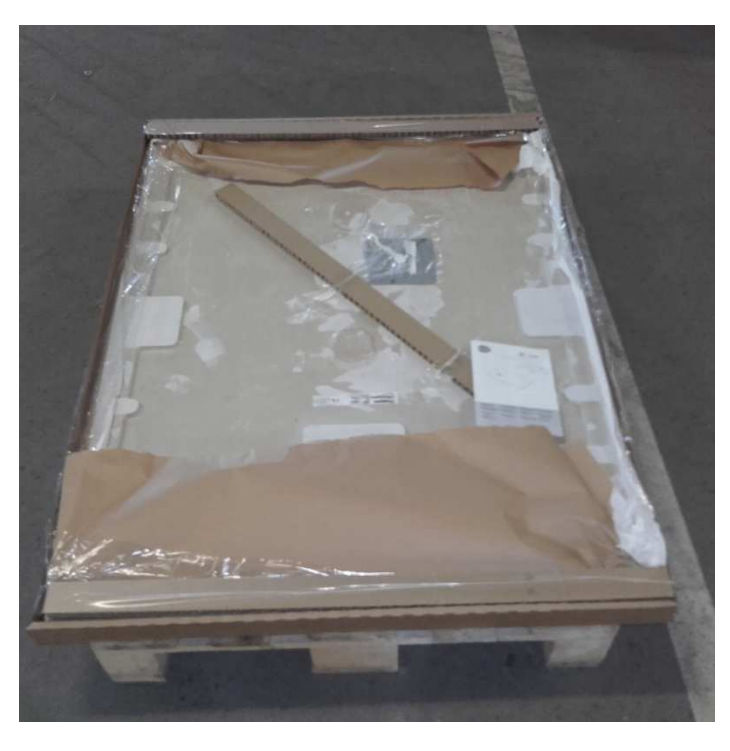
Each box contains: Shower tray (bottom site up) covered with an intersection and paper 3 cardboard fillers Instruction