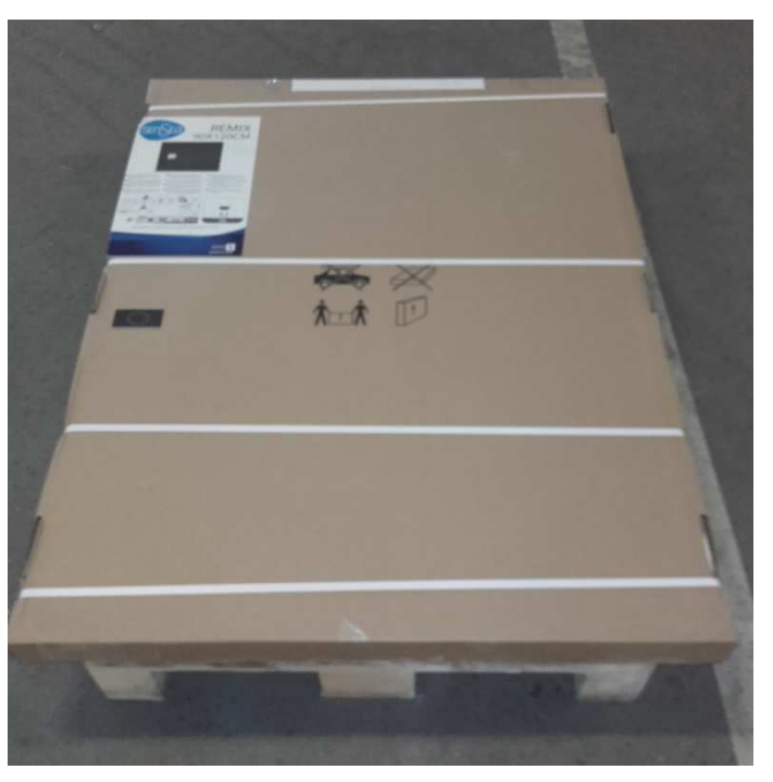
Each box is assembled with 4 PET bands